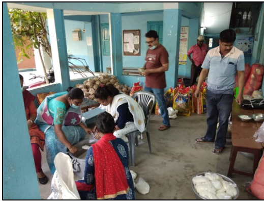
Food being packed

Under Dr. Sujit Brahmochary's leadership, a Corona Virus Awareness Group (CVAG) was formed with experienced, senior volunteers, most of whom have worked with IIMC since its inception, plus many dedicated, young volunteers working for IIMC from different sub-centres in remote areas.