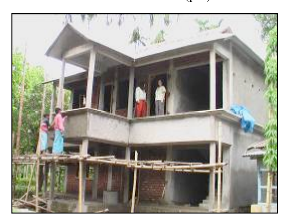
New Peace Library in September 2008.

Nonetheless, more is needed. The appeal has been extended to the end of 2008. For further information and excellent photographs of work in progress (as at last July) see the links to the GUP pages on <a href="http://www.settlequakers.org.uk/12.html">http://www.settlequakers.org.uk/12.html</a> which at time of writing still records the end of September as the deadline, though it has in fact been extended. (pls)